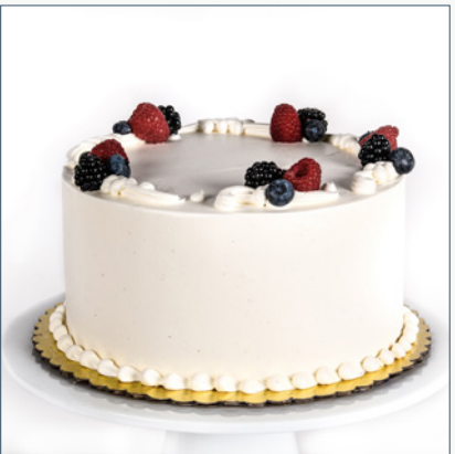
CASCADE BERRY WHITE CHOCOLATE MOUSSE CAKE Vanilla sponge cake, white chocolate mousse, fresh Northwest berries & white chocolate buttercream