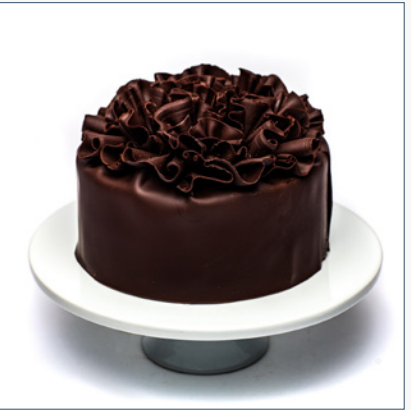
DARK FRENCH CHOCOLATE RUFFLE CAKE Dark chocolate cake, salted caramel mousse filling & fine French couverture chocolate ruffles