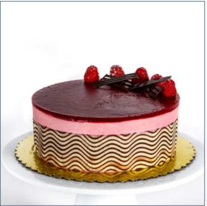
RASPBERRY BAVARIAN CAKE Vanilla sponge cake, Bavarian cream & fresh raspberries