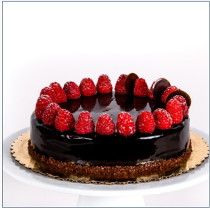
CHOCOLATE DECADENCE Dense, rich flourless chocolate cake, chocolate glaze & fresh raspberries (gluten free)