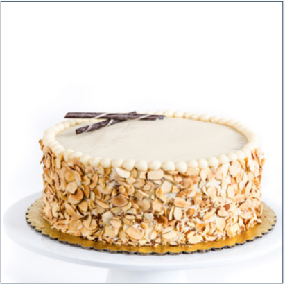
CLASSIC CARROT CAKE Carrot cake, vanilla bean cream cheese frosting, finished with toasted almonds