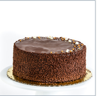
CHOCOLATE MOUSSE GANACHE CAKE Dark chocolate cake, rich chocolate mousse