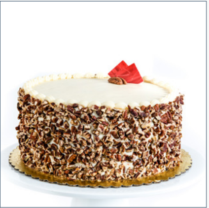
RED VELVET CAKE Traditional red velvet cake filled & frosted with vanilla bean cream cheese frosting & pecans