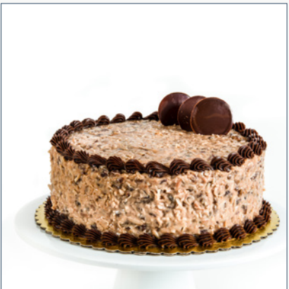
GERMAN CHOCOLATE CAKE Chocolate cake filled & frosted with coconut pecan filling