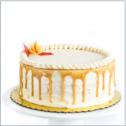
STICKY TOFFEE CAKE Stout cake with maple mousse filling & maple buttercream