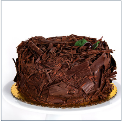
BLACK FOREST CAKE Chocolate cake layered with Chantilly cream, chocolate mousse & brandied cherries, fully enrobed with chocolate ganache & chocolate shavings