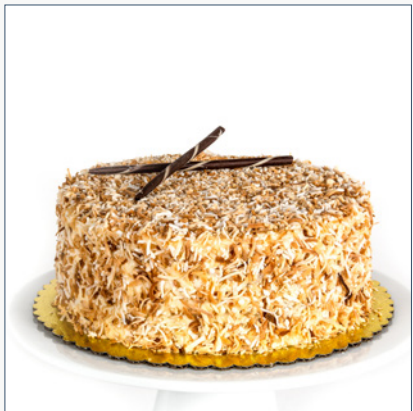
SHAVED COCONUT CREAM CAKE Coconut butter cake, coconut pastry cream filling & toasted shaved coconut cream cheese icing