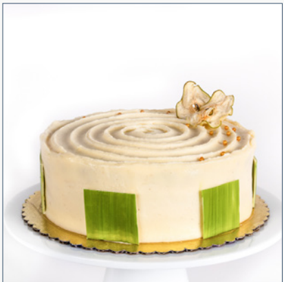
YAKIMA PEAR SPICE CAKE Spiced pear cake filled with vanilla bean cream cheese frosting