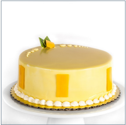
LEMON CHIFFON CAKE Vanilla chiffon cake, lemon mousse & fine white chocolate glaze