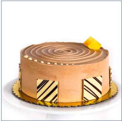
MILK CHOCOLATE BANANA CAKE Banana cake & milk chocolate mousse